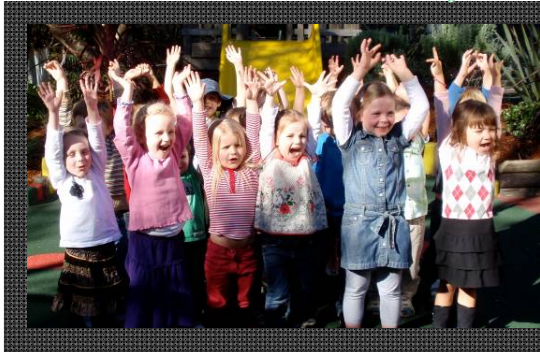
Hot Dog Dancers in action.