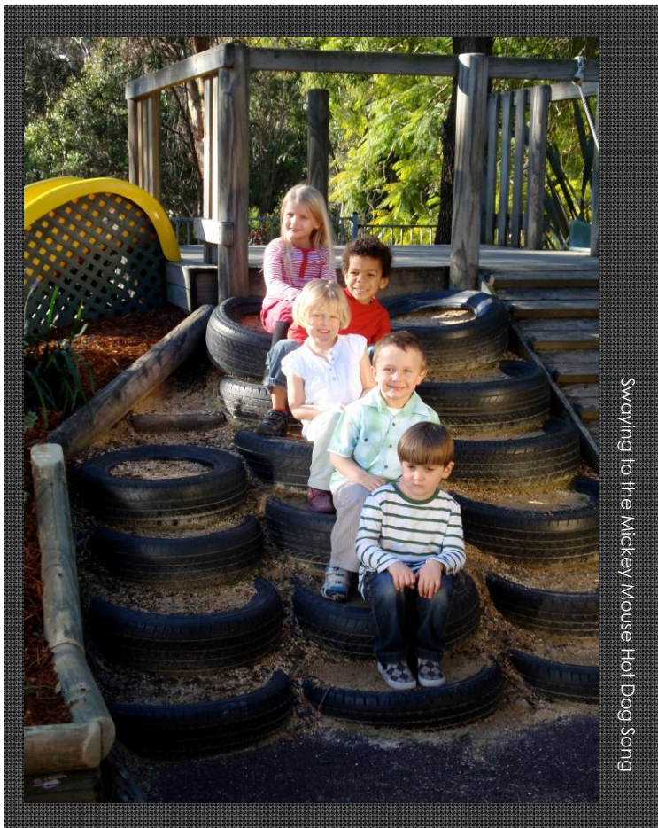
Swaying to the Mickey Mouse Hot Dog Song

Topp Boutique in Beecroft donated vouchers to the Trivia Night this year. They primarily stock Indian clothing but also carry a beautiful selection of felted bags, jewelry, knitted hats and gloves, shawls, ponchos and even Indian-dressed Barbies. Wonderful gift ideas - give it a go. Beecroft Village Arcade, Hannah St.