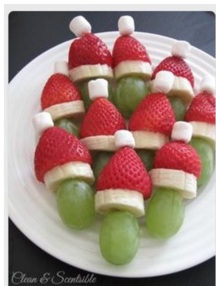
Fruity Santa hats